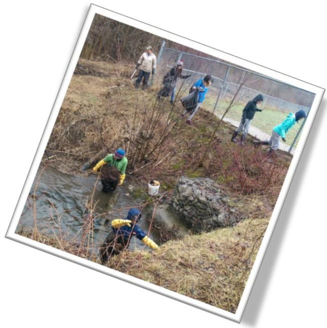
The pictures (clockwise from top left) show our students engaging in work with Turtle Concepts at Laurentian University, Earth Day learning, Earth Day stream clean up and Earth Day arts projects.