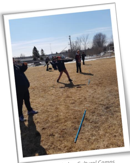
Outdoor learning with Great Lakes Cultural Camps