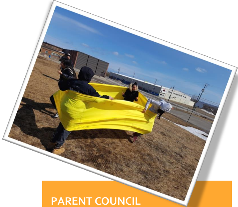
The pictures (clockwise from top left) show our students engaging in activities with Great Lakes Cultural Camps, finished products in Ms. Peltier's class, GLCC activities and Grade six science projects showcasing knowledge of the solar system.