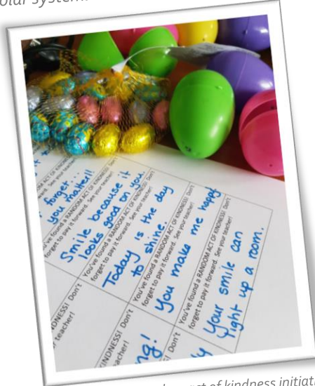
This Spring we kicked off a random act of kindness initiative where students provide a treat and a positive note for the next person who receives the egg they hide. Its goal is to put a smile on someone's face.

The next parent council meeting will occur in May. Please watch out for additional information (date and time) on our website calendar and upcoming correspondence.