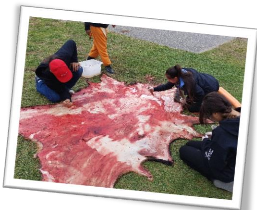
Students learned how to skin an elk hide with Great Lakes Cultural Camps. More pictures will be shared next month with a story to follow!