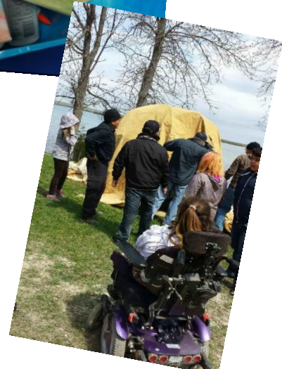
Grade six students planted seedlings and built a smoker hut during their field trip to the South Bay Centre.

LOST AND FOUND ITEMS WILL BE ON DISPLAY AT THE FRONT DOOR UNTIL FRIDAY, JUNE 24 TH . ANY UNCLAIMED ITEMS WILL BE DONATED.