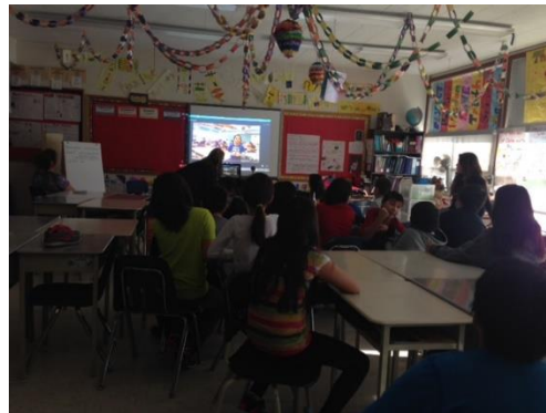
5P students skyped with Jr. School students as a part of a nonfiction writing project. 6E artwork showcased how students used different textures to celebrate Valentine's Day.