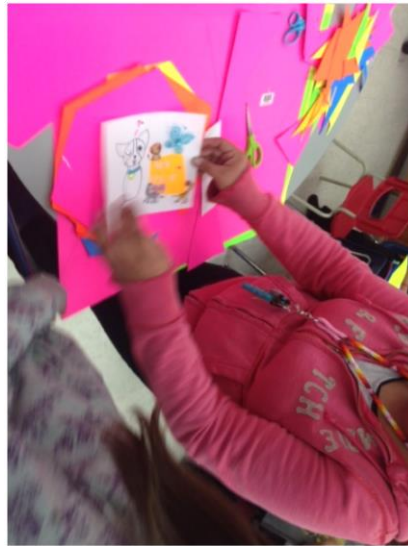
Debahemujig continue to work with 5C, 6E & 6P students on the Quilt of Belonging Project.