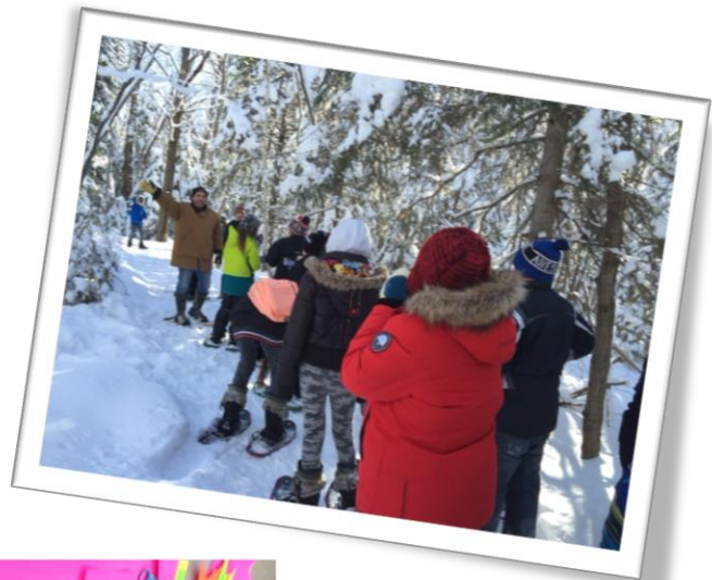
6P & 6E students snow shoeing at McLean's Park