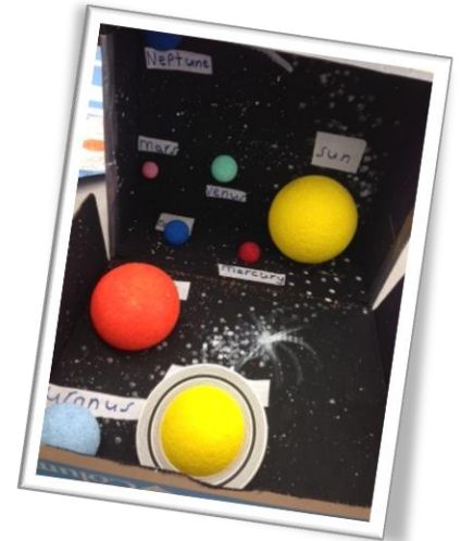
6P & 6E students studied the solar system this year and created various displays showcasing their knowledge.